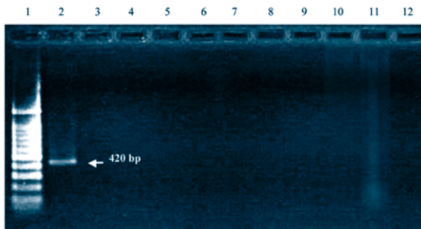
Fig 3 Agarose gel electrophoresis showing PCR products from different dilutions of Pg -positive fresh blood samples, detected by outer primers in the first amplification. Lane: 1 = DNA marker, 2 = positive control ( Pg DNA), 3 = dilution 10^7 , 4 = dilution 10^6 , 5 = dilution 10^5 , 6 = dilution 10^4 , 7 = dilution 10^3 , 8 = dilution 10^2 , 9 = dilution 10, 10 = undiluted Pg -blood, 11 = uninfected whole blood, and 12 = negative control.